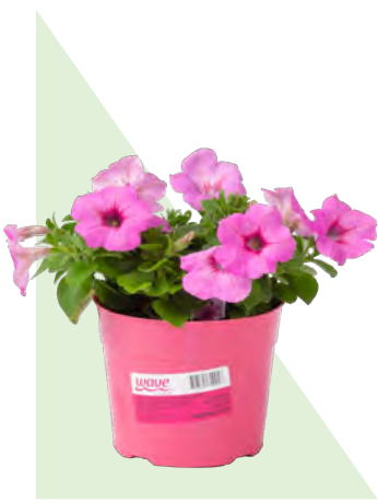
6" WAVE® PETUNIAS