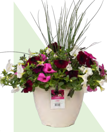
11" WAVE® PETUNIA POT