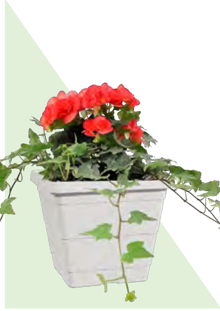
7.5" BEGONIA COMBO