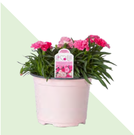
6" I LOVE YOU CARNATION