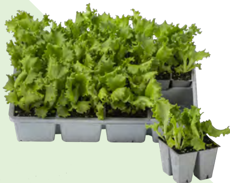
804 COOL WEATHER VEGETABLES