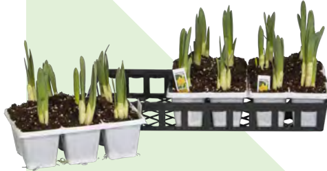
306 PACK BULB