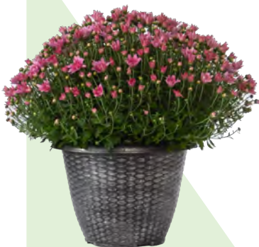
13" MUM MONO