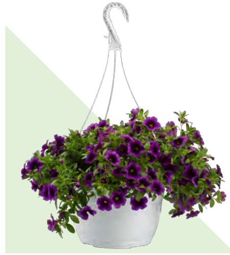
11.5" VEGETATIVE PETUNIAS