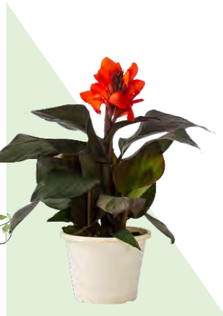
8" MOJAVE CANNA