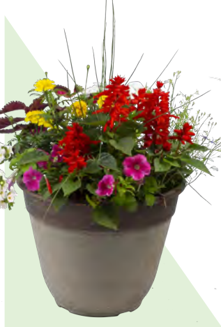
14" QUARTZITE COMBO