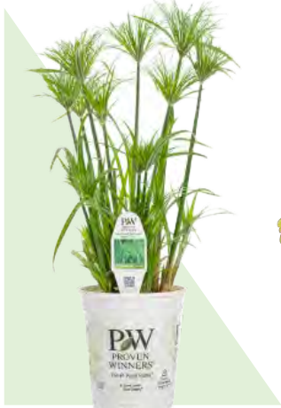
1 QUART GRACEFUL GRASSES®