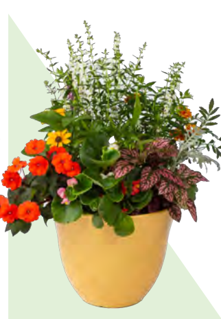
13" HONEYSUCKLE POT