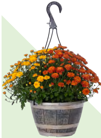
10" NAPA HANGING BASKET