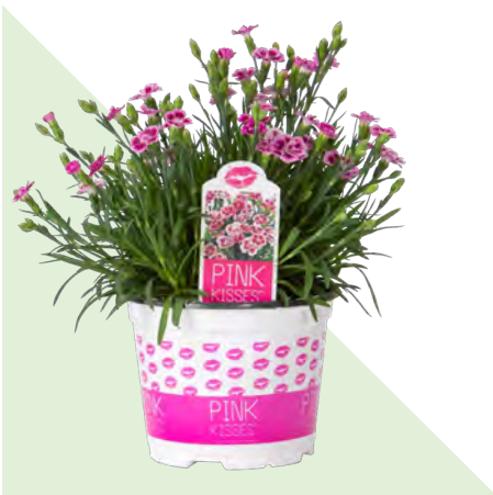
6" PINK KISS® DIANTHUS