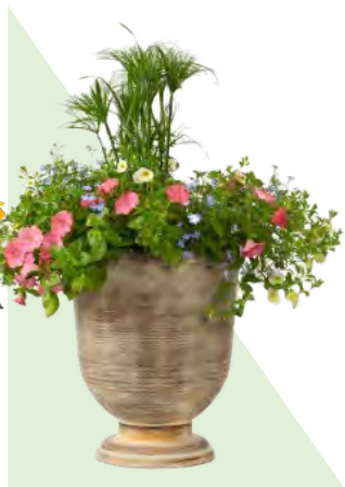
16" PROVEN WINNER® URN COMBOS