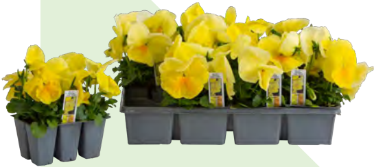
806 PACK PANSY & VIOLAS