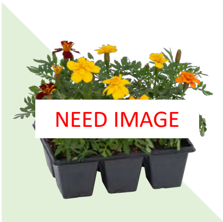
306 ANNUAL PACKS