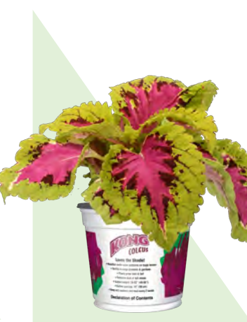
1 GAL KONG COLEUS®