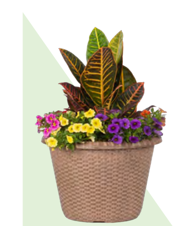
12" EASTLAKE SUMMER PLANTER