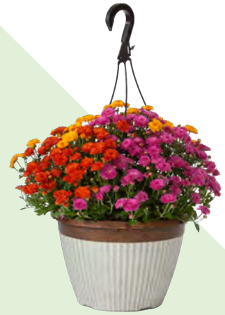
11" TRI-COLOR MUM HANGING BASKET