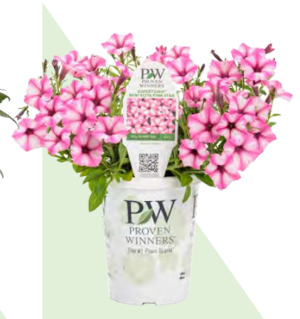
1 QUART PROVEN WINNER®