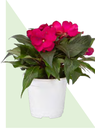
433 PREMIUM ANNUALS