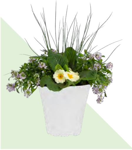
1.5 GAL EARLY SPRING COMBO