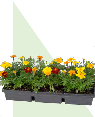
306 PACK ANNUALS