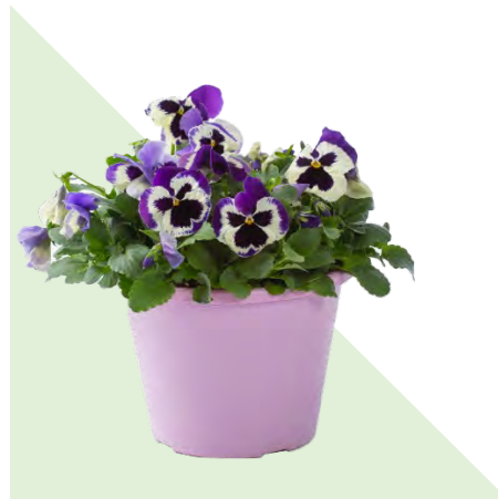
8.5" COLOR POT PANSY