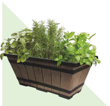
12" BURPEE® NAPA WINDOW BOX HERBS