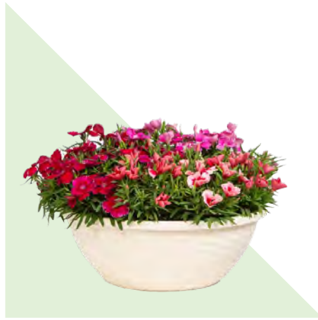
17" DORADO DIANTHUS BOWL