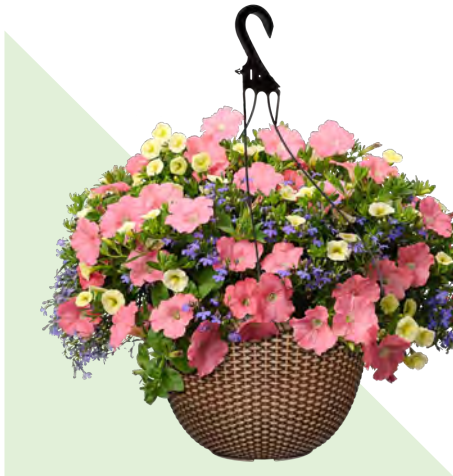
16" PROVEN WINNER® EASTLAKE HANGING BASKET