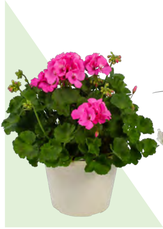
8.5" PREMIUM WINCHESTER