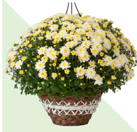
12" WICKER HANGING BASKET