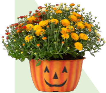
8" MUMKIN PLANTER