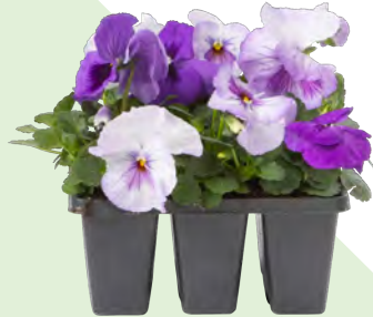
306 PACK PANSY & VIOLAS