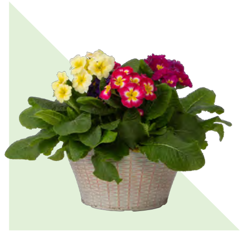
12" PRIMROSE BOWL