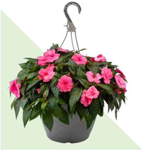
11" PREMIUM HANGING BASKET