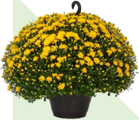
10" MUM HANGING BASKET