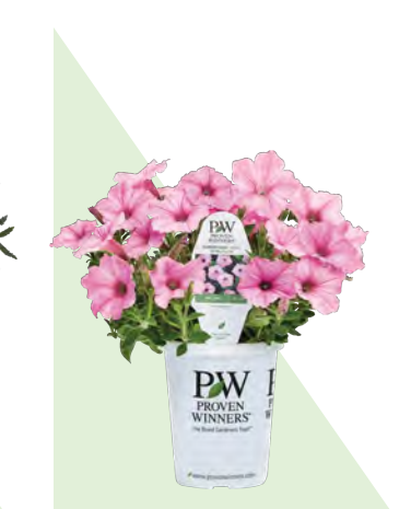
1 GALLON PROVEN WINNER®