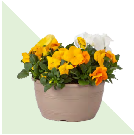
12" PANSY BOWL