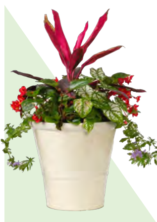
16" FLAIR PLANTER COMBOS