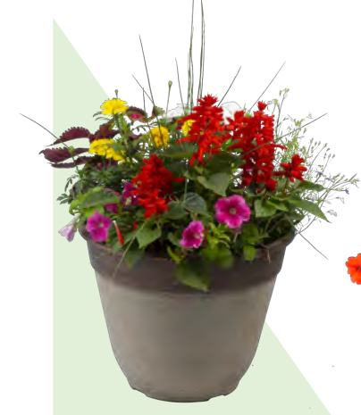
14" QUARTZITE COMBO PLANTER