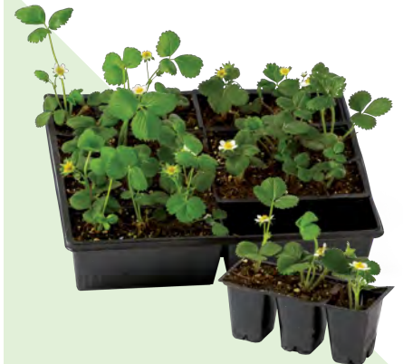
803 PACK STRAWBERRIES