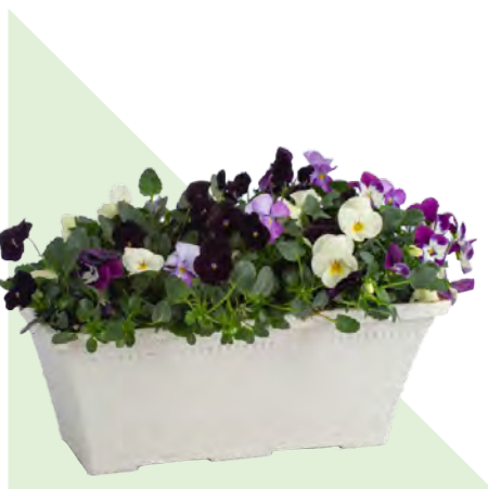
15" COOL WAVE® PANSIES