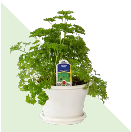
6" BURPEE® DECO POT W/SAUCER