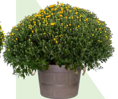
BUSHEL BASKET MUM