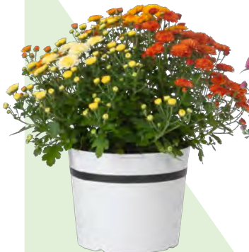
8" WHISKEY BARREL