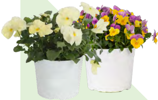
6" PANSY & VIOLAS