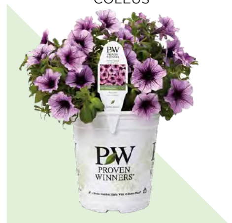
1 GAL PROVEN WINNER®