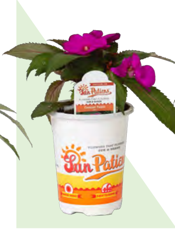
1 QUART SUNPATIENS®