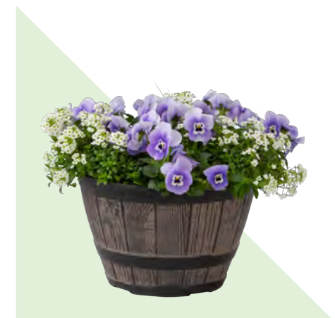
8" WHISKEY BARREL