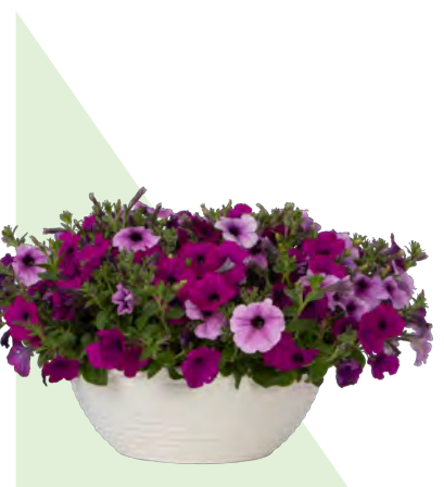
17" DORADO BOWL WAVE® PETUNIAS