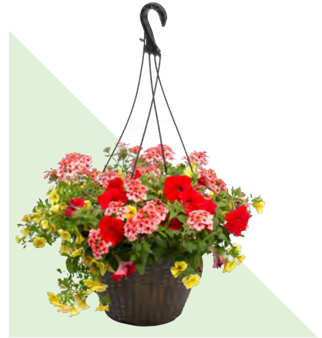
12" PREMIUM HANGING BASKET