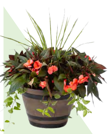
15" WHISKEY BARREL COMBOS