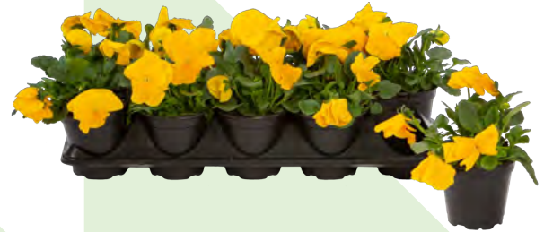
4" PANSY & VIOLAS