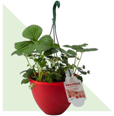
10" STRAWBERRY HANGING BASKET