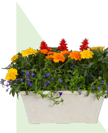
15" ANNUAL WINDOW BOX COMBO