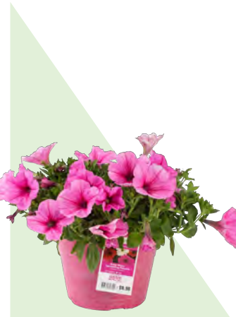
8.5" PREMIUM ANNUALS