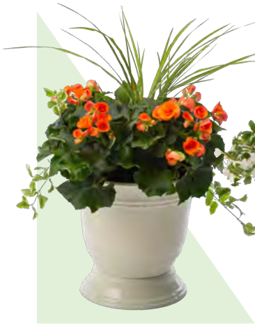
12" URN COMBOS