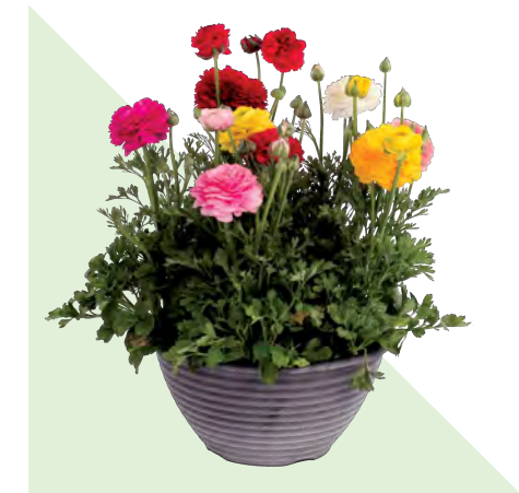
12" RANUNCULUS BOWL