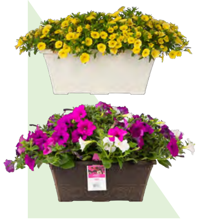
15" WINDOW BOXES CALIBRACHOA & WAVE®