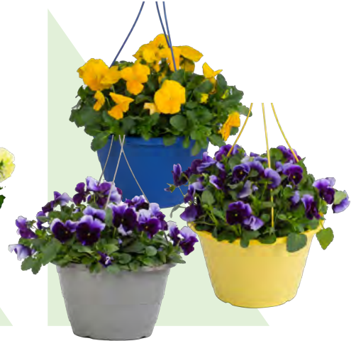
10" PANSY HANGING BASKETS