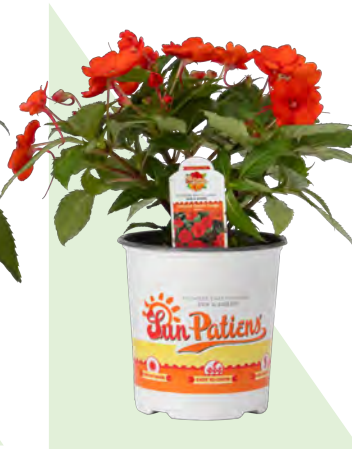
1 GAL SUNPATIENS®