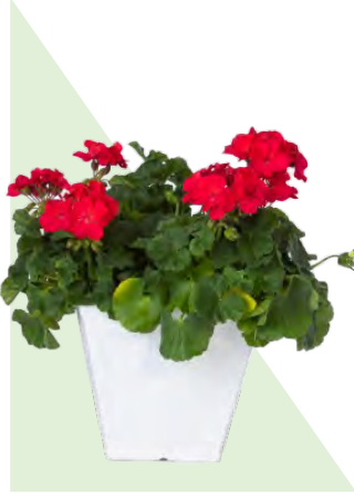
7.5" HANOVER GERANIUM