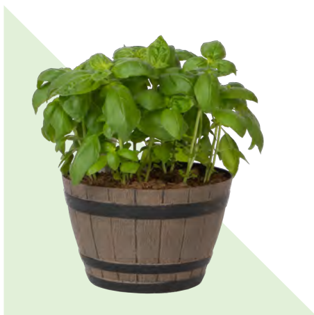
8" WHISKEY BARREL BASIL