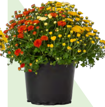
8" TRI-COLOR MUM