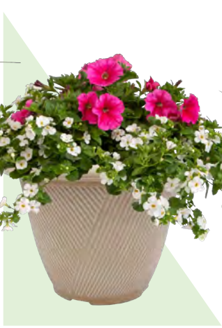
13" PREMIUM ANNUAL COMBO