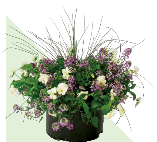
10" EARLY SPRING COMBINATION