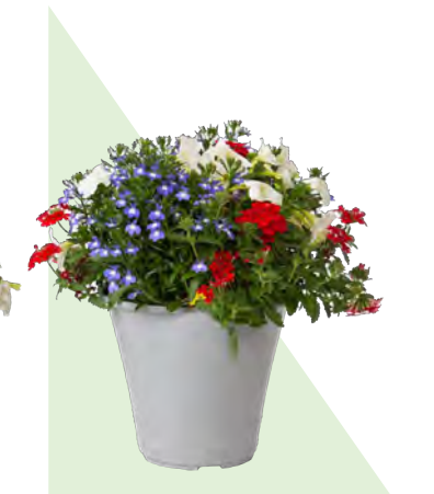
1.5 GAL SUMMER COMBO