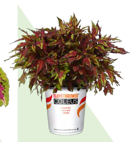
1 GAL FLAMETHROWER® COLEUS