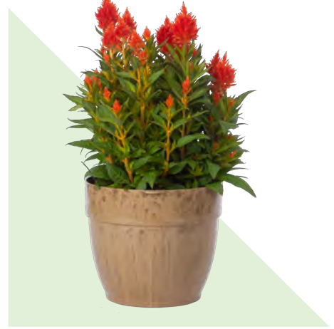
8" RADIANCE CELOSIA