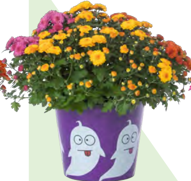
8" GHOST POT