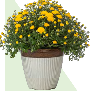
8" MUM PLANTER